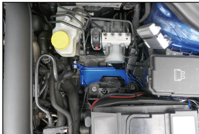
Illustration of installed state 安裝完成示意圖