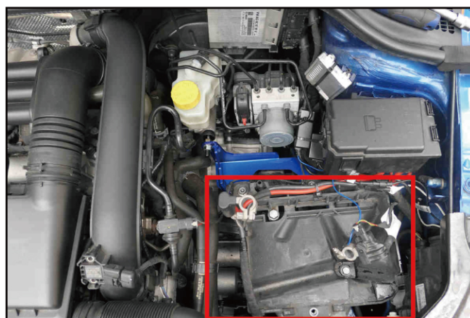
See figure 1 (參考圖表一)