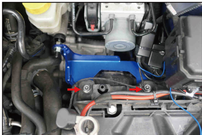
See figure 2 (參考圖表二)