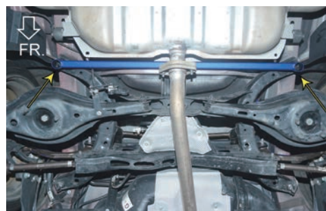
Illustration of installed state 安裝完成示意圖