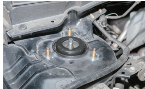
Illustration of installed state 完成示意圖